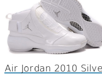
Air Jordan 13 Retro shoes black white ID:6061 Free Shipping